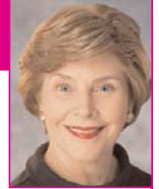
Former First Lady Live via Satellite

According to Gallup Polls, Laura Bush is one of the most popular and beloved first ladies of all time. In this inspiring session Laura Bush will provide candid insights from her experiences as First Lady and show you how you can step into your full potential to live a successful, fulfilling life.