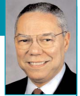
World Famous Soldier-Statesman

General Colin Powell, USA (Ret.) is one of the most distinguished and admired men in America. A four-star General, chairman of the Joint Chiefs of Staff and Secretary of State, General Powell has experienced leadership at the highest levels.