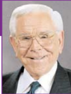
America's Best Inspirational Speaker

Dr. Robert Schuller is the bestselling author of more than 25 books and the Father of Possibility Thinking. Whether it's poor health, loneliness, financial challenges, fear or anything else that blocks your success, you can turn your negative into a positive.