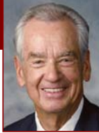
America's #1 Motivator

Zig Ziglar is the solid gold standard in motivation. He has transformed millions of lives around the globe with his profound secrets to success in business and life. Don't miss the masterful Zig Ziglar as he shares life-changing wisdom - sprinkled with generous portions of down-home humor and cutting-edge insights.