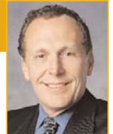
Legendary President of Microsoft