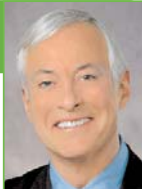
America's Top Authority on Selling

Brian Tracy is the country's leading expert on the development of the human potential and corporate performance. Brian will teach you how to prosper for a lifetime - in virtually any industry, and in ANY economy! Overcome the "Economy" Objection - Every Time! Bring Sales Up When the Market is Down How to Stay Focused and Stay Motivated - and Keep on Selling How to Overcome Objections and Close the Sale